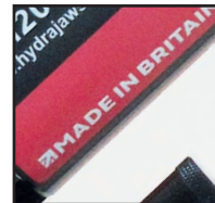
Made in Britain.

Telescopic legs for quick and easy height adjustment.