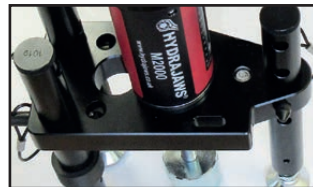
Improved load spreading bridge design.