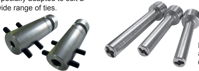
Inset wall tie adaptors - 6mm, 8mm & 10mm

Specially adapted to suit a wide range of ties.